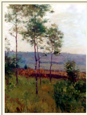
Spring Landscape - John Henry Twachtman